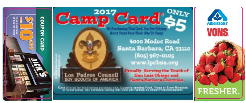
Every year Scouts are continually faced with one big problem:

There is never enough money to go around. There always seems to a camp out or trip that you desperately want to attend but you cannot find the funds and you miss out on the experience.