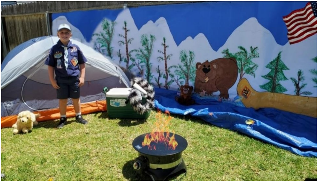
Quarantine Camp Contest Winner