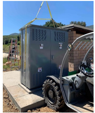
New Electrical Panel

The recent pandemic has forced us to reconsider the opening of The Outdoor School. The new objective is for October 2021. The remaining 2-six bedroom buildings and 3 cook staff buildings have been put on hold until more funding can be found to complete the project. Naming opportunities for camp supporters for any of the buildings are available, anyone interested?