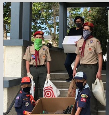
Pack 122 & Troop 26 Scouts dropping off face shields at CALM in Santa Barbara