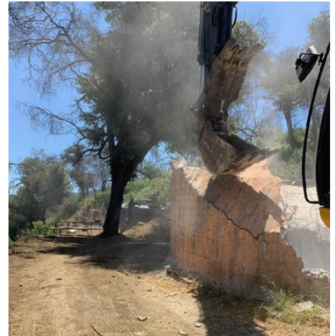
Old Water Tank being Demolished