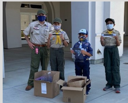
Pack 93 & Troop 87 Scouts dropping off face shields at Marian Medical Center

As our Scouts focus on doing a good turn daily, they accepted the call to action to produce and donate over 1,000 face shields to medical workers and first responders. We had Scout from Santa Barbara and San Luis Obispo participate and contribute to this worthy cause in the month of May.