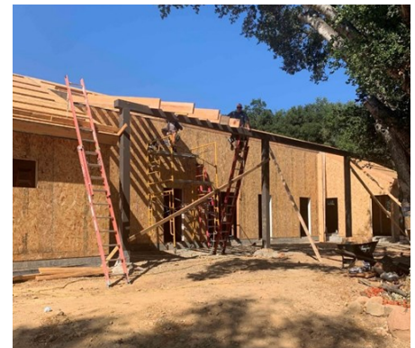
Fourth Dorm Progress