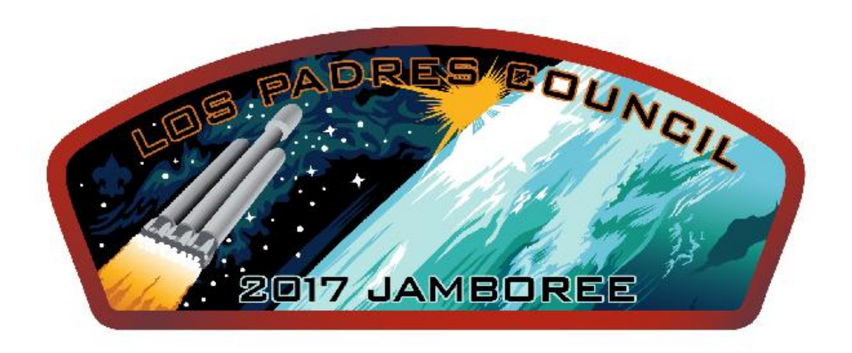
Pie Patch is 7" X 5"