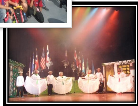
XIX Central American Moot, Panama City, Panama