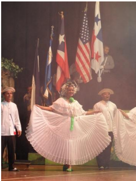
XIX Central American Moot, Panama City, Panama

Aug 2-8, 2012 (A BSA contingent will attend.)