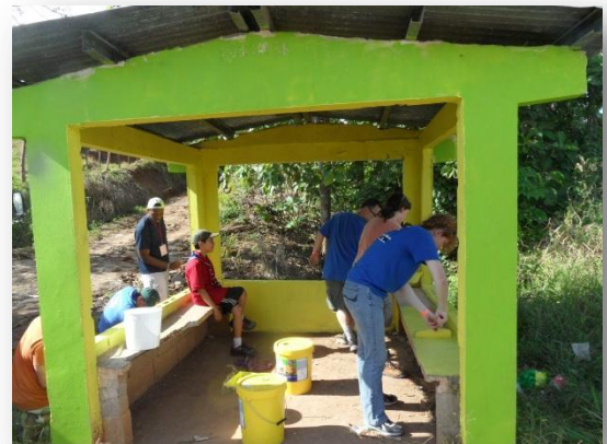
BSA contingent: service project in a village, Panama